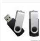
Metal Usb Flash Drive